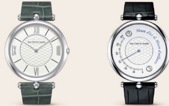
Pierre Arpels, 38mm Gold bracelet paved